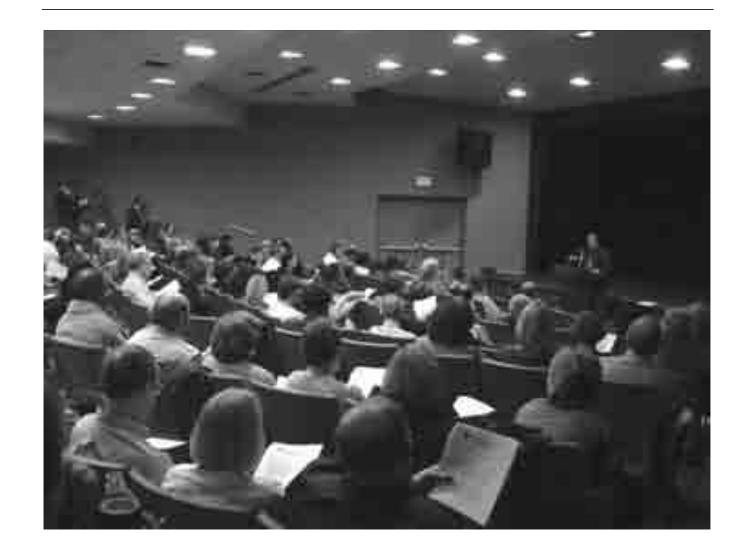
KFT Emergency Meeting